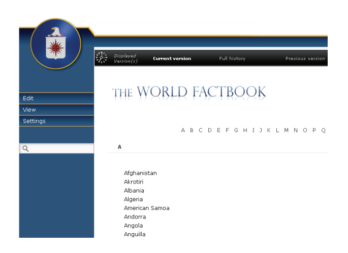
Figure 3: CIA World Factbook web interface in DB-WIKI with time machine and edit menu

Users interact with DBWIKI through a web browser, making requests encoded using URLs for either brows-