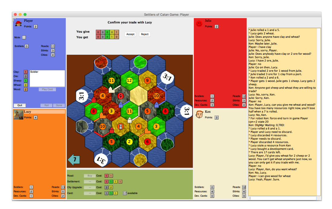
Figure 1: Graphical interface of the adapted online Settlers game-playing client, showing the state of the board itself, and in each corner information about one of the four players, seen from the perspective of the human player sitting at the top left (playing with blue; the other 3 players are bots). The human player is prompted to accept the trade displayed in the top middle part, as agreed in the negotiation chat shown in the panel on the right hand side.